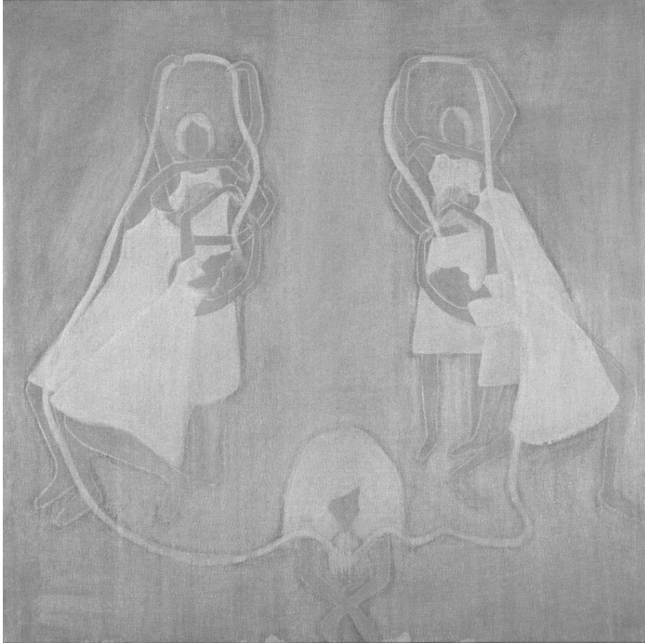
The Bride's Chamber Scene Watercolour and gouache on canvas, 100 × 100 cm (Silke Otto-Knapp, 2005)