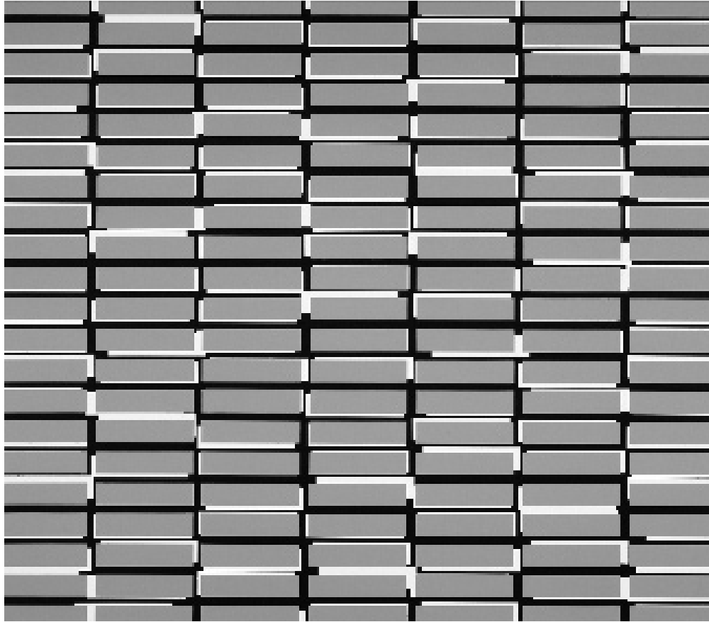
OT Acrylic on cotton, 140 × 160 cm (Esther Stocker, 2007)