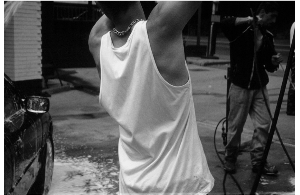
Car Wash 4 × 80 slides, 4 × Kodak Ektapro 5020 slide projectors, 4 × Unicol projector stands (Hilary Lloyd, 2005)